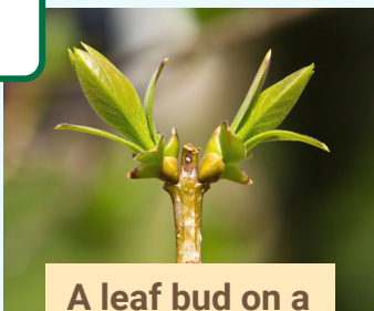
A leaf bud on a lilac branch

"All around there is history to see I'm at a fruit vault from the 1850s!! Tucked away by a door in the hillside I am watching the flowers open wide." - Minshall the Gnome