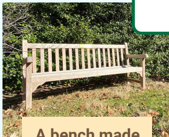
A bench made of wood