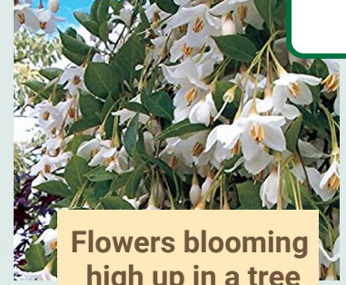
Flowers blooming high up in a tree