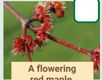
A flowering red maple tree branch