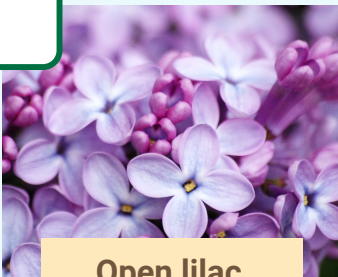
Open lilac flowers