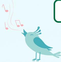
The sound of a bird singing