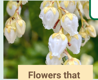
Flowers that look like bells