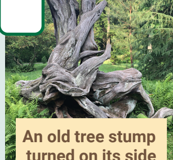
An old tree stump turned on its side