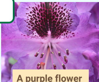
A purple flower with spots

"Where a maze will stand in summer and fall, A sea of yellow now blooms for all. Find cardinal directions marked on 4 large stones I am in the north standing alone." -Hoopes the Gnome