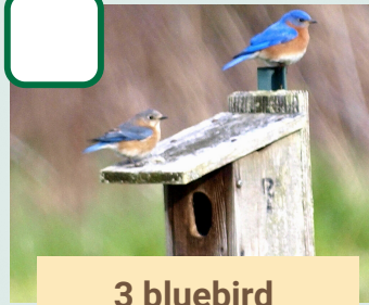
3 bluebird houses