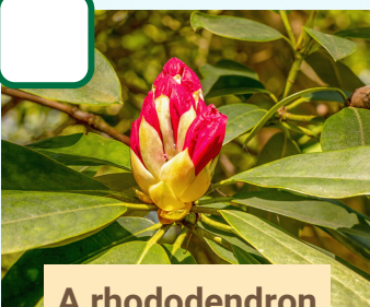
A rhododendron bud